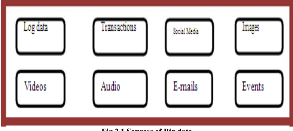
Fig.2.1 Sources of Big data

recent years means that the variety and amount of big data continue to grow. Much of that growth comes from unstructured data.